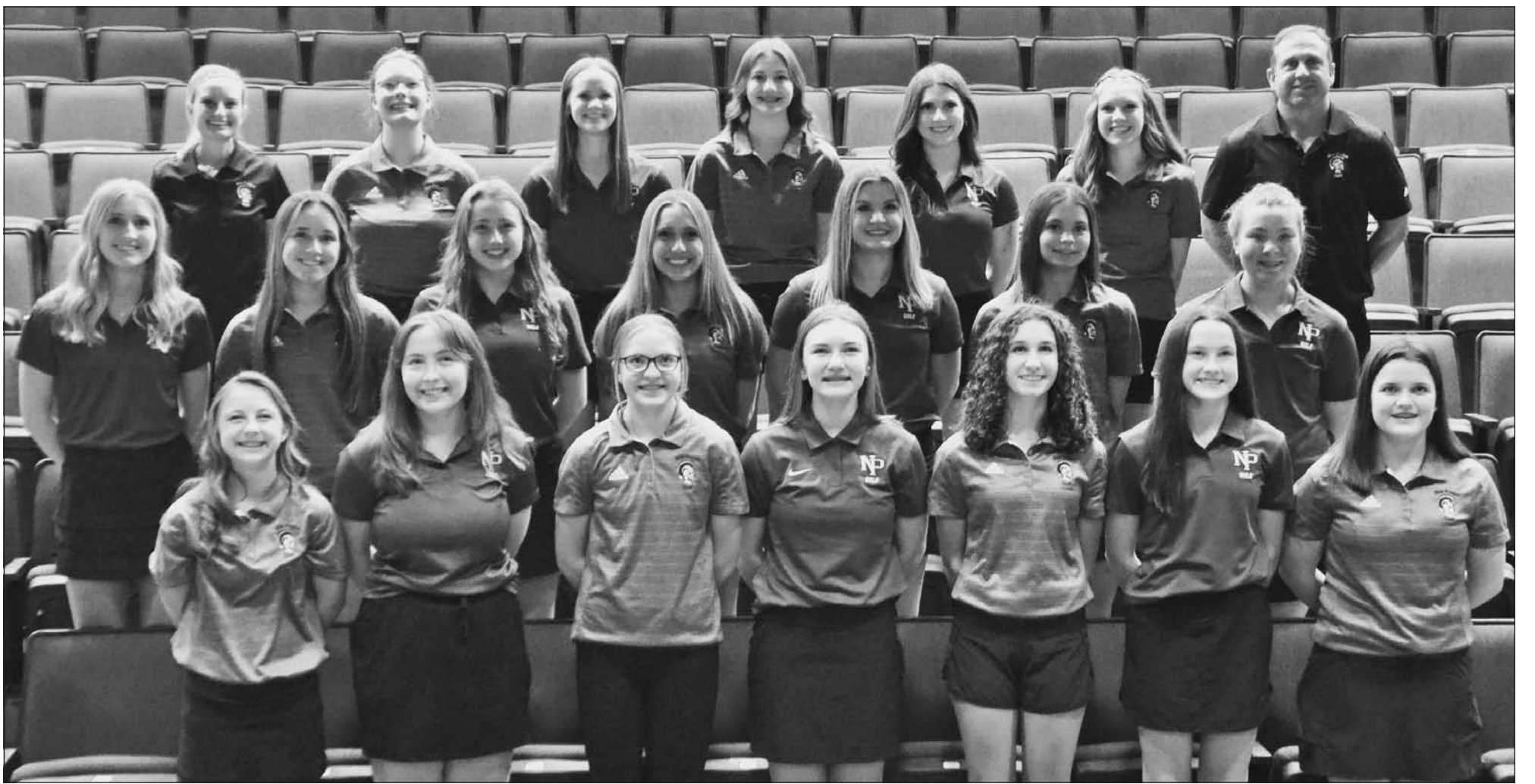
The girls golf team for 2021 at New Prague High School.

Excited for the season. We have a lot of new golfers this year. It is exciting to see how much the sport has taken off since the start of COVID.