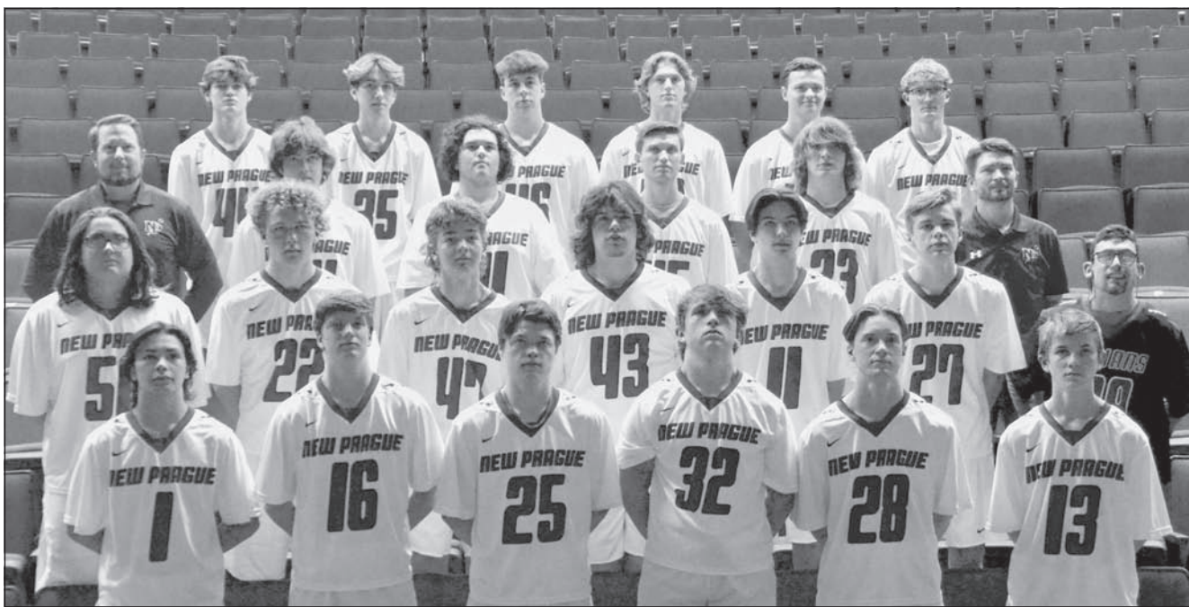
The boys lacrosse team for 2021 at New Prague High School.

Playing up to and beyond our ability, not beating our-