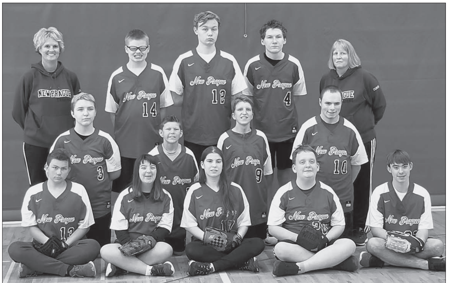
The adapted softball team for 2021 at New Prague High School.

First we hope our team to build great relationships with their team members.. At the same time learn the ins and outs of the game and sharpen their skills. This will be a learning year for all of our new players and our success will depend on their learning the positions and building their skills.