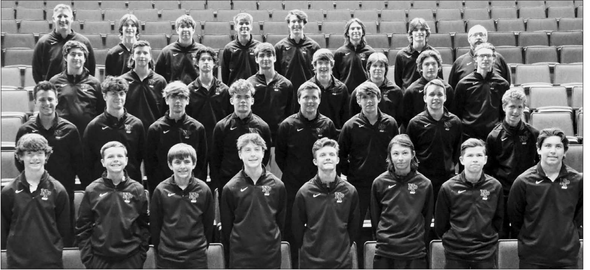
The boys golf team for 2021 at New Prague High School.