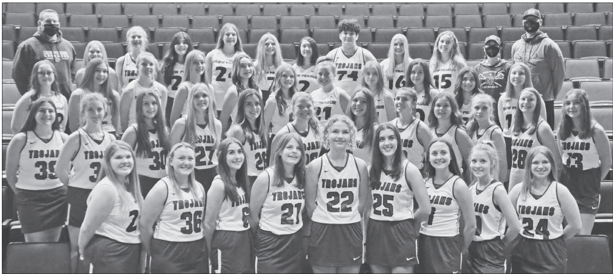
The girls lacrosse team for 2021 at New Prague High School.

a positive experience. I can see their positive spirits from the guys just being outside rain or shine, bantering with teammates, and getting to play. Win or Lose we want to try hard, be good sports, and work together!