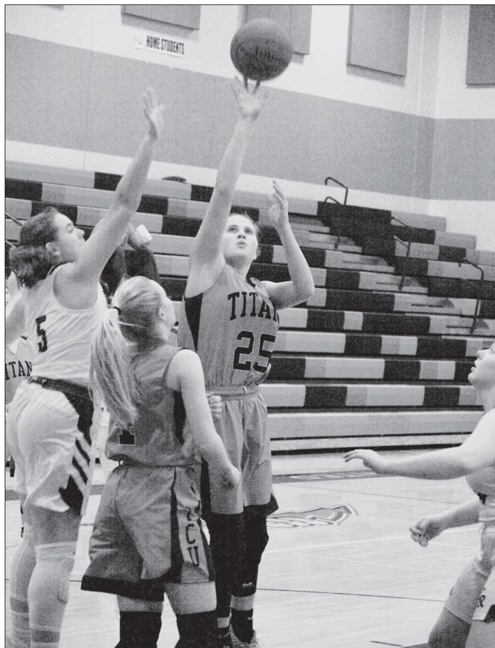
Messenger file photos