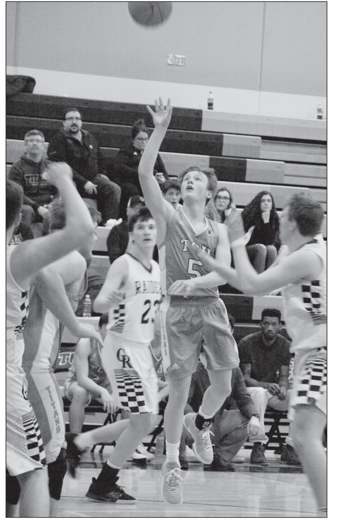
Messenger file photos